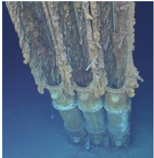
USS Sammy B torpedo tubes

"It was an extraordinary honor to locate this