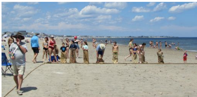
Blackie lines up the racers(Above); The food! (Rt); Cars & trucks await

set up from 8:30 - 9:30 AM or so, and then enjoyed a near cloudless sunny day on the Duxbury sands. It was high tide when we arrived, but by noon low tide was fast approaching. Numerous attendees took refreshing dips in the water, only to be shocked by how cold it was. Needless to say, they didn't stay long in the ice cold drink, though the numbing water did help cool them off from the 90°+ temperatures on the beach.