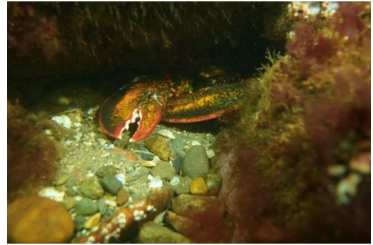
Lobster claws peek-a-boo; dive flag; view from Commando; Rock Gunnel in the crack

changed my lens setting to Macro and tried some more. Only one of the photos of the half dozen or so came out relatively OK.