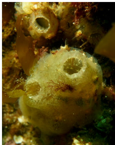
Above: Sea Grape; R: Lumpfish